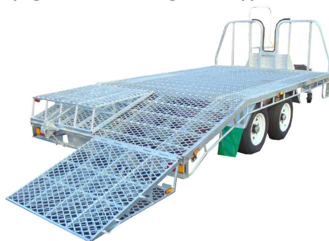
When ramps are down it is easy to drive up. Each ramp has gas strut & springs so the weight is less than 8kg each making easy and safe to swing up

Manufacturers and designers of horticultural equipment