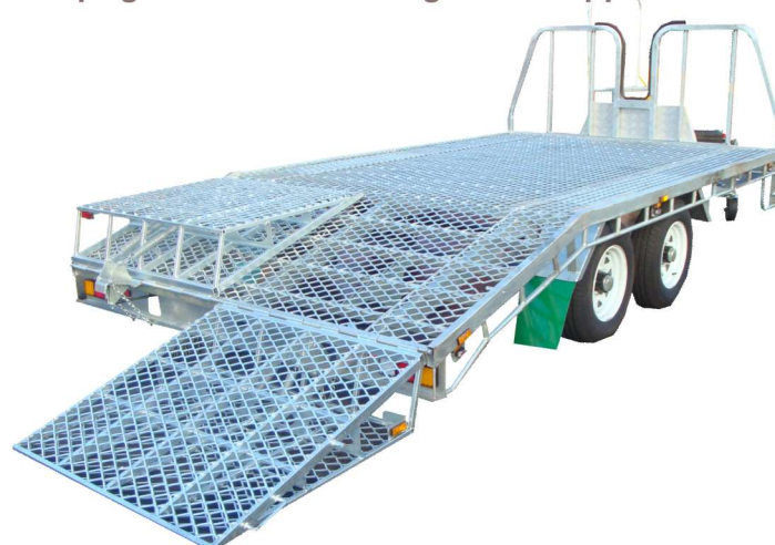
When ramps are down it is easy to drive up. Each ramp has gas strut & springs so the weight is less than 8kg each making easy and safe to swing up

Manufacturers and designers of horticultural equipment