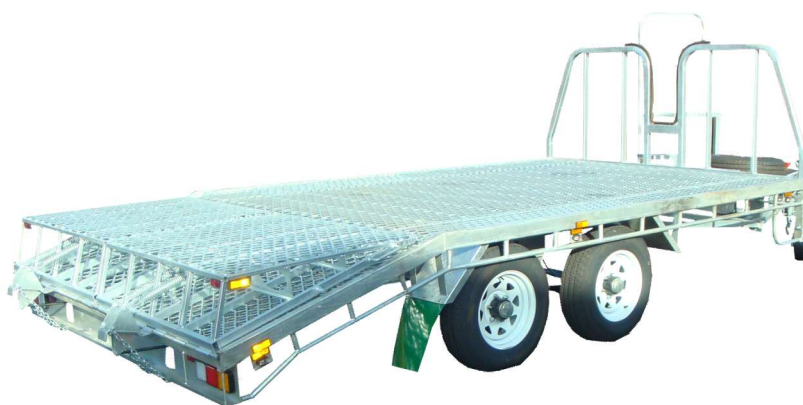
Squirrel Trailer Flat Top with a medium drawbar. Ramps folded right over to give flat top