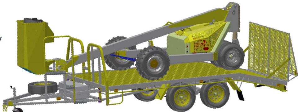
358, 508, 558 & 536 Squirrel on a Trailer flat top with a short drawbar.