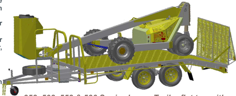
358, 508, 558 & 536 Squirrel on a Trailer flat top with a short drawbar.