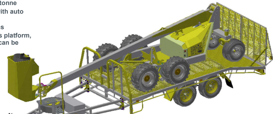
678, 656 & 708 Squirrel on a Trailer flat top with a medium drawbar.