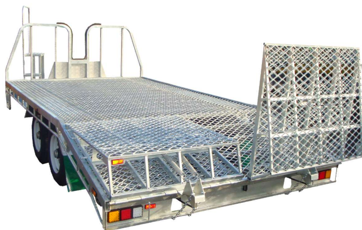
Ramps folded right over to give flat top. Four tension springs make this easy to swing over or can be held upright with side locking brace supplied.