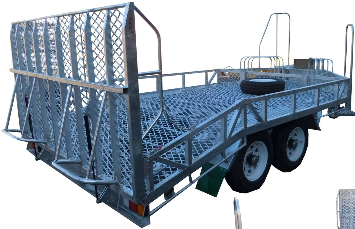
Rear ramps assisted by 2 Gas struts Side frame on ramp and trailer provide strength and safty