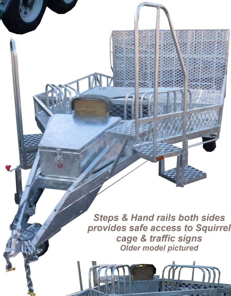
Steps & Hand rails both sides provides safe access to Squirrel cage & traffic signs Older model pictured