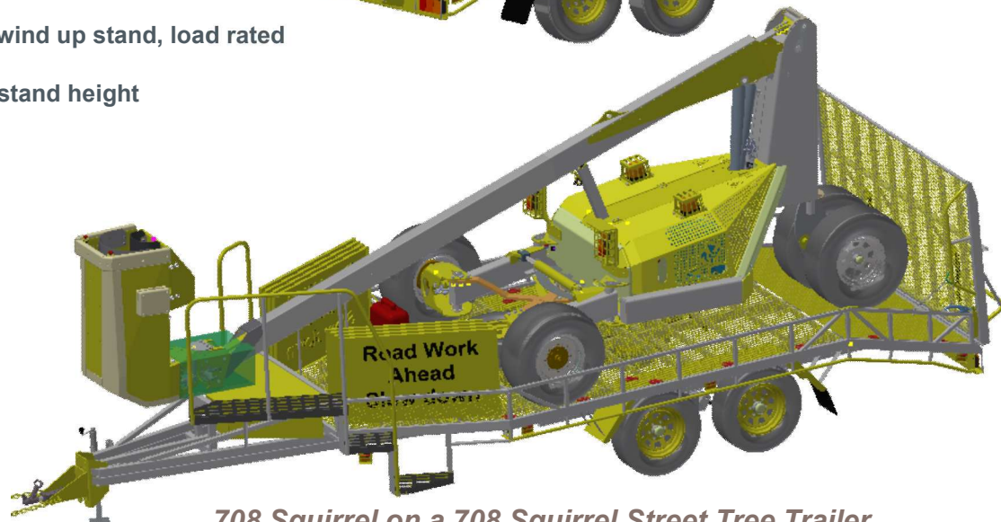
708 Squirrel on a 708 Squirrel Street Tree Trailer

Manufacturers and designers of horticultural equipment