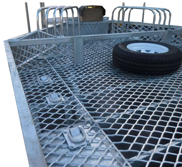
Floor is 6mm floor mesh with Heavy tie down lugs in floor