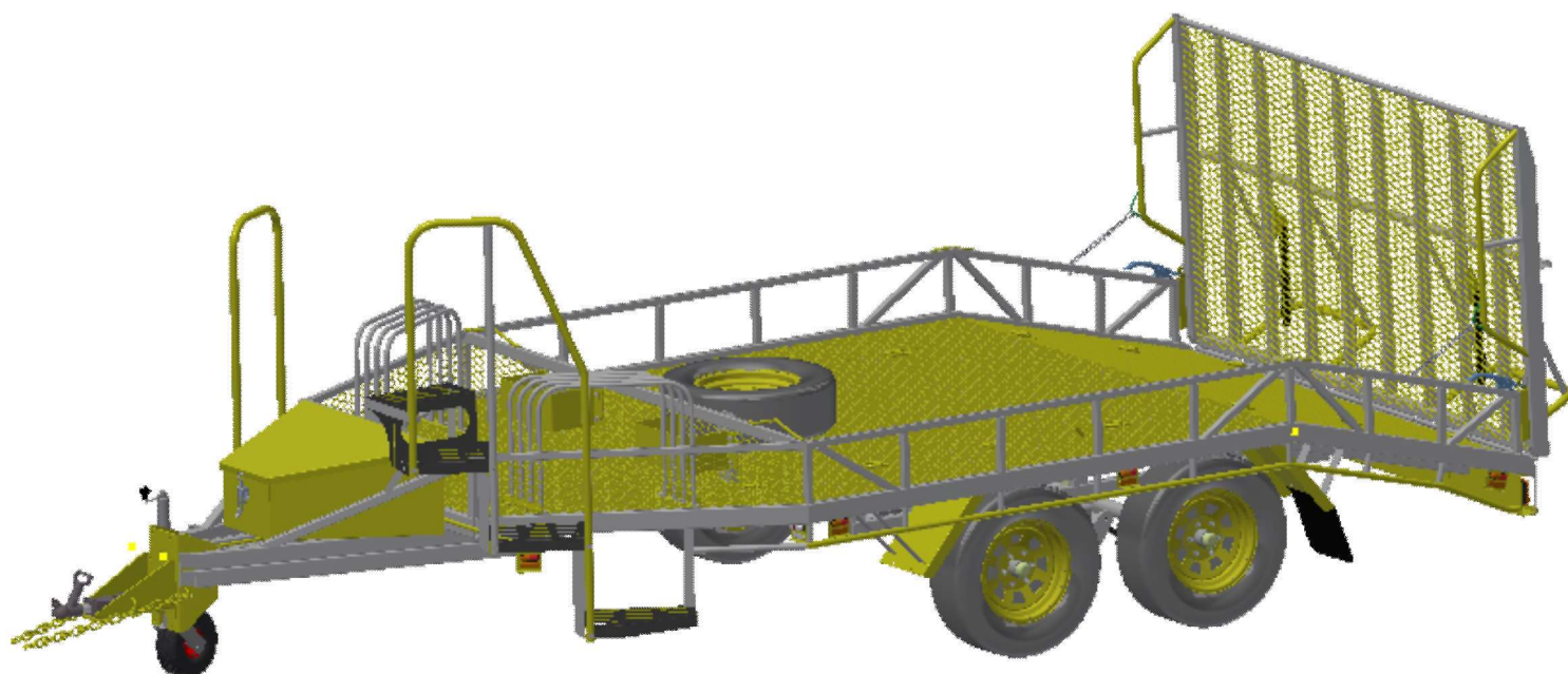
508 Squirrel Street Tree Trailer .