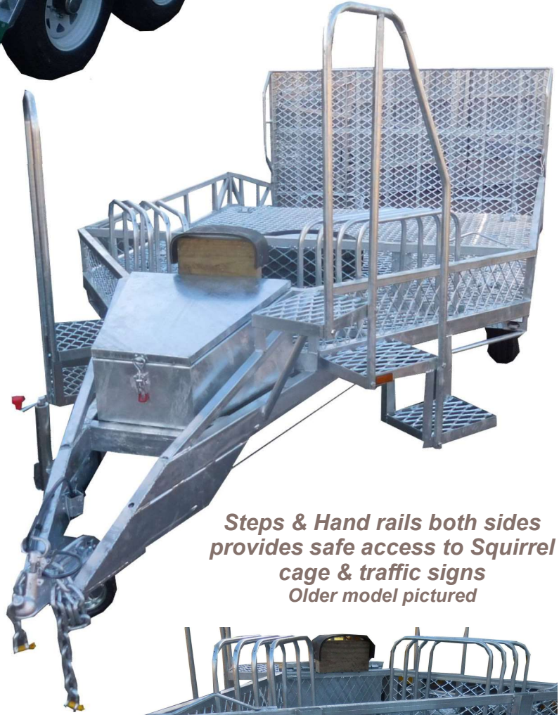
Steps & Hand rails both sides provides safe access to Squirrel cage & traffic signs Older model pictured