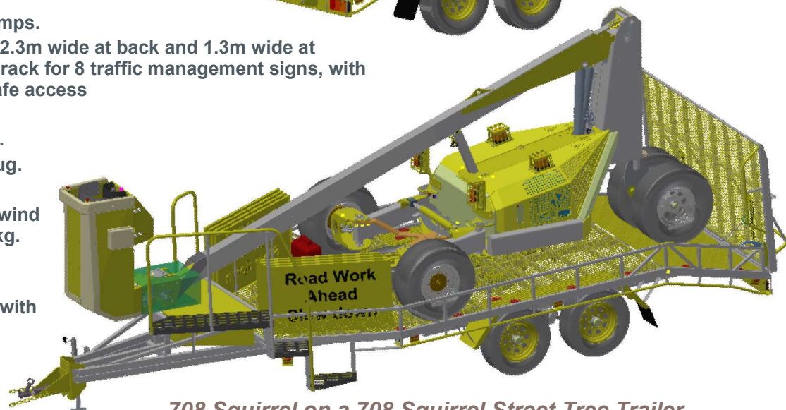
708 Squirrel on a 708 Squirrel Street Tree Trailer

Manufacturers and designers of horticultural equipment