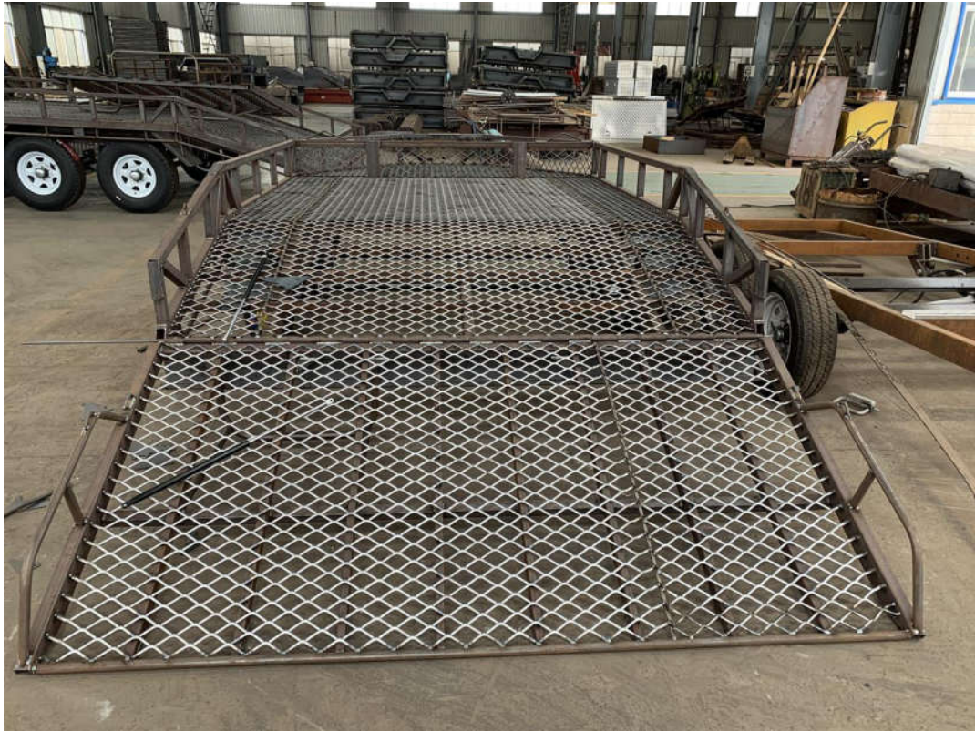
Short Squirrel Trailer rear Ramps down