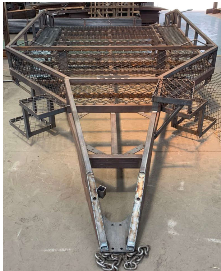
Short Squirrel Trailer Front