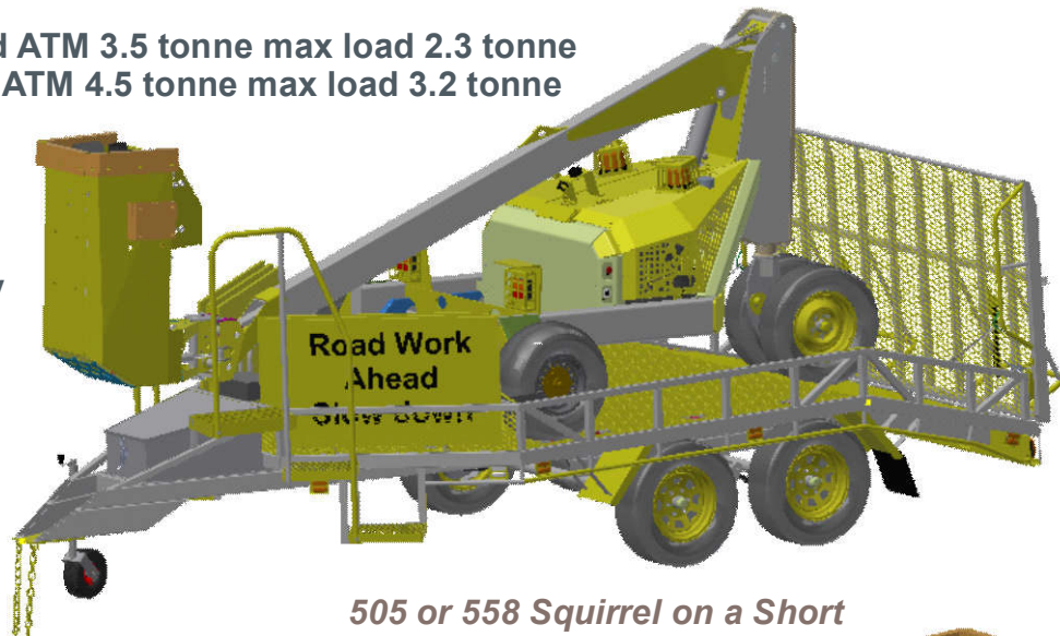
505 or 558 Squirrel on a Short Squirrel Street Tree Trailer