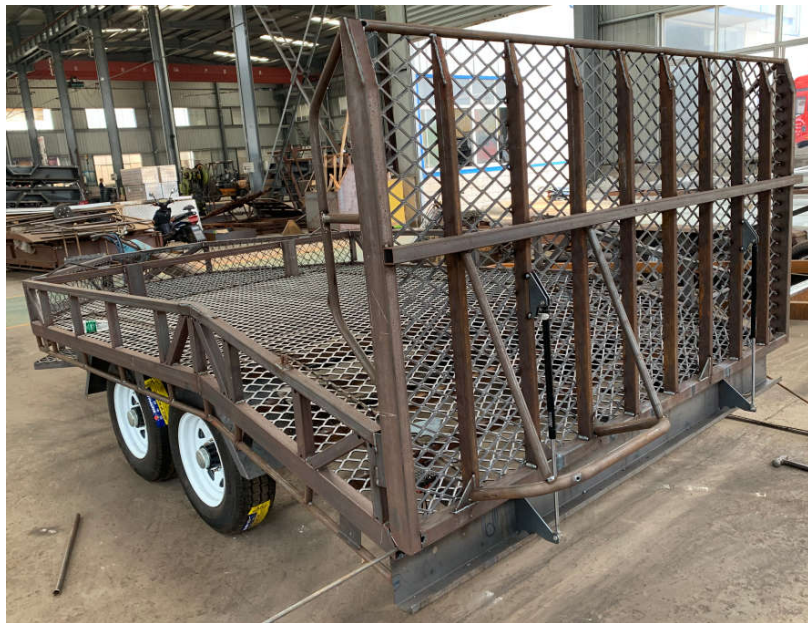
Short Squirrel Trailer rear Ramps up